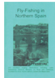
Fly-Fishing in Northern Spain Philip Pembroke

Areas covered include provinces of Lugo, Ourense, Pontevedra and Coruña. Fly-fishing for trout, sea trout, Black bass, pike, barbel and salmon.