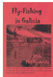
Fly-Fishing in Galicia Philip Pembroke

275 superb angling destinations: including the rivers Sella, Narcea, Cares, Eo, Esva, Nalón and Navia. Number one for salmon in Spain. But it's also excellent for trout and sea trout.